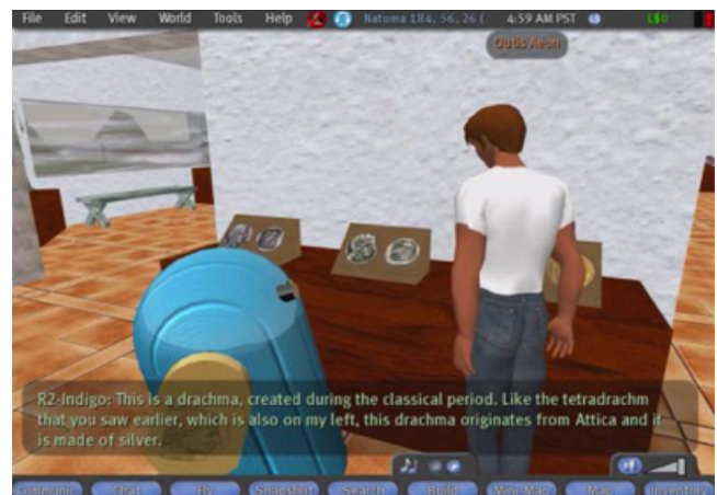
Figure 1: Generating texts in Second Life.

templates instead of systemic grammars, it is publicly available as open-source software, it is written entirely in Java, and it provides native support for OWL ontologies, making it particularly useful for Semantic Web applications (Antoniou and van Harmelen, 2004). 3 Well known advantages of natural language generation (Reiter and Dale, 2000) include the ability to generate texts in multiple languages from the same ontology; and the ability to tailor the semantic content and language expressions of the texts to the user type (e.g., child vs. adult) and the interaction history (e.g., by avoiding repetitions, or by comparing to previous objects).